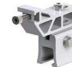
Folding clamp 2.1 K 15TPF Product number: 802471 (Domitec profile roof)