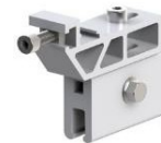
Folding clamp 2.1 RD-80 TPF Product number: 802469 (Domico GBS, Zambelli 465)