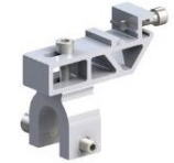
Round seam clamp 2.1 TPF Product number: 802460 (Round seam profile roof)