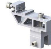
Angled standing seam clamp 2.1 TPF Product number: 802462 (Angle standing seam roof)